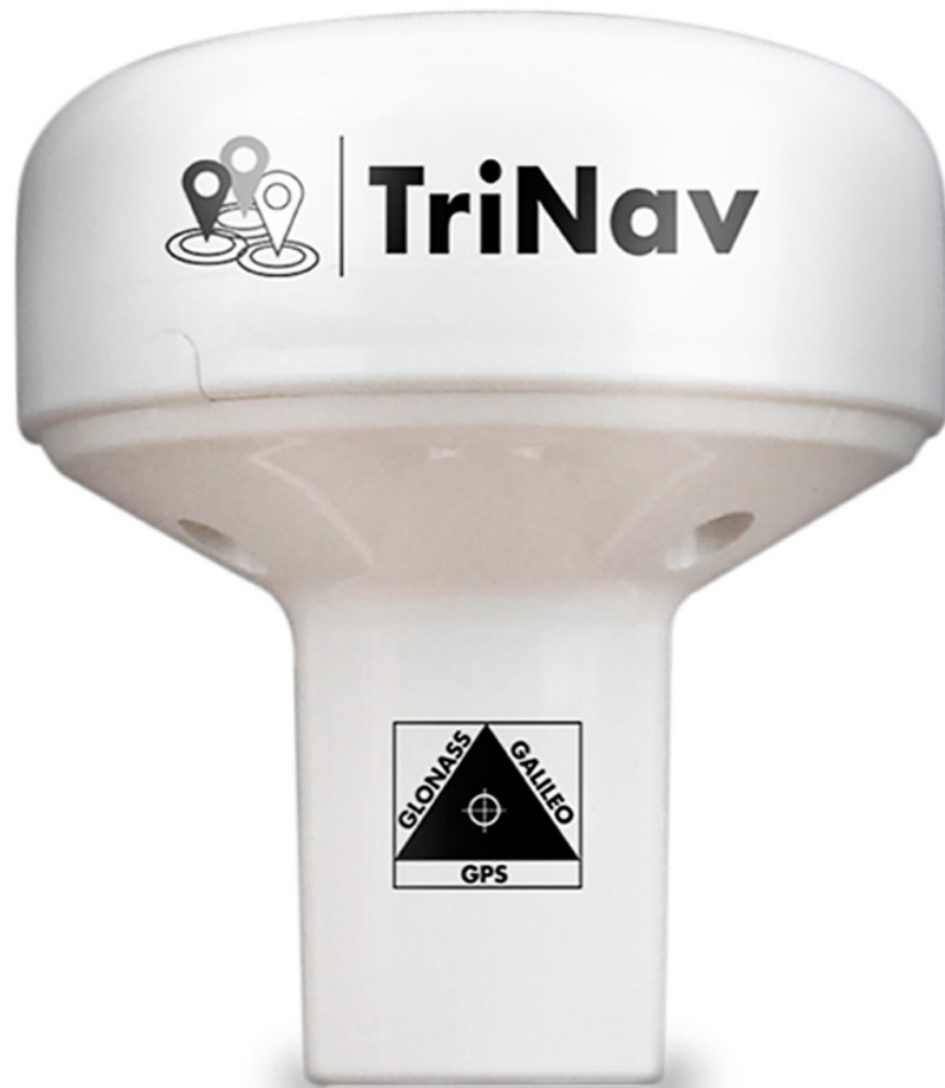
GPS160 TriNav Positioning Sensor