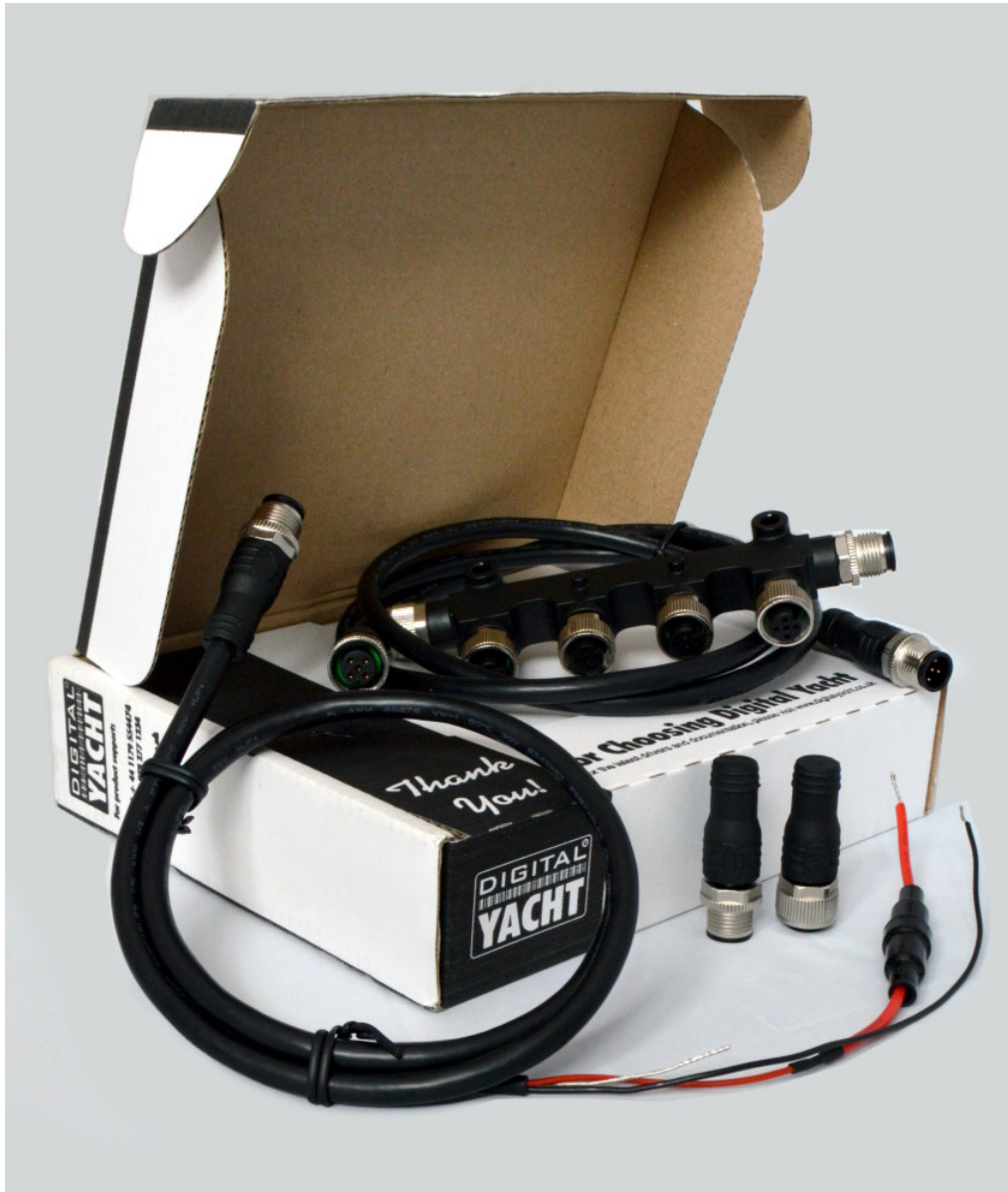
Digital Yacht's NMEA 2000 Starter Kit makes installing modern marine electronics a breeze